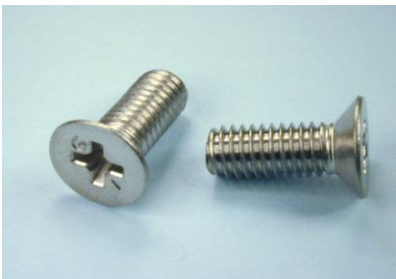
MS24693C / NAS662C